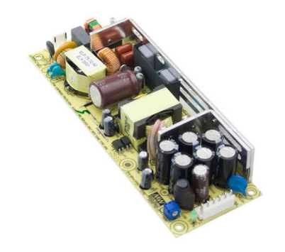
Figure 1. Typical Switched Mode LED Driver showing 8 major Electrolytic Capacitors in use.

This temperature related lifetime limitation demands that the power supply must be run cool. Mounting the power supply directly on the LED heat sink, or under a hot roof, can severely compromised the power supply lifetime.